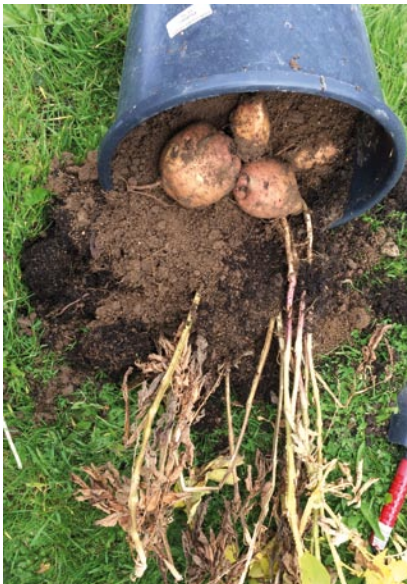
Sixth year Ag science students harvesting their first potato crop